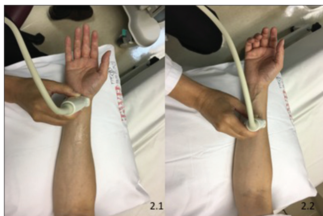
Figure 2: Ultrasound assessment. (2.1) Assessment of cross-sectional area and perimeter over the inlet of carpal tunnel at the wrist; (2.2) assessment of cross-sectional area and perimeter of one-third of the distal forearm

and other peripheral neuropathies; (2) abnormal anatomical structures (e.g., bifid structure of median nerve) displayed via ultrasound; and (3) surgical history at the wrist.